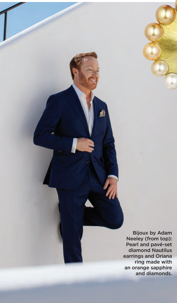
Bijoux by Adam Neeley (from top): Pearl and pavé-set diamond Nautilus earrings and Oriana ring made with an orange sapphire and diamonds.

SOURCE OF INSPIRATION: “I’m constantly inspired by the natural world: the curve and proportions of a shell, the gradient colors of the twilight sky, or an extraordinary gemstone—any of these might be the spark that lights a design vision.” adamneeley.com —L.R.